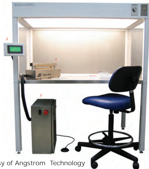
Flow hood

The Accu-Seal Model 830 Validatable Medical Sealer was designed, built and tested to give years of reliable, trouble free performance.