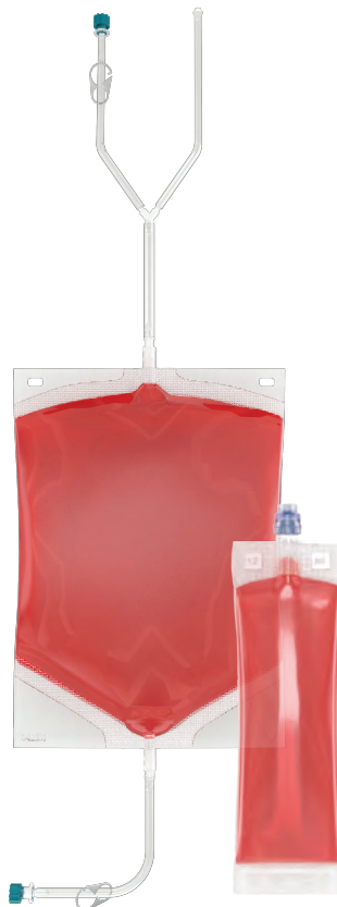
BioLoc™ CCN bags