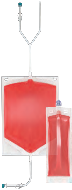
BioLoc™ CCA bags