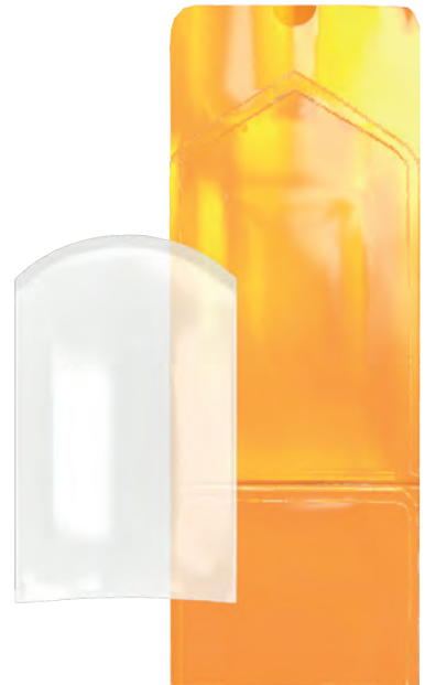
CryoLoc™ Freezing Overwraps Peelable and non-peelable variations available

Multiple manufacturing and distribution locations with shortest lead times in the industry