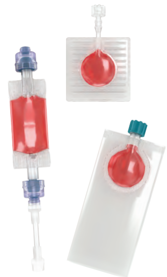
CryoLoc™ CTF Vaccine Aliquots