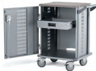
Optional Accu-Seal Cart

The Accu-Seal 8000 Series was designed, built and tested to give years of reliable, trouble free service.